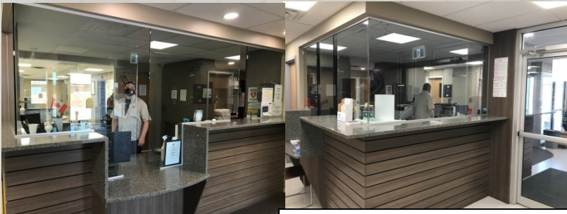
New Reception Desk