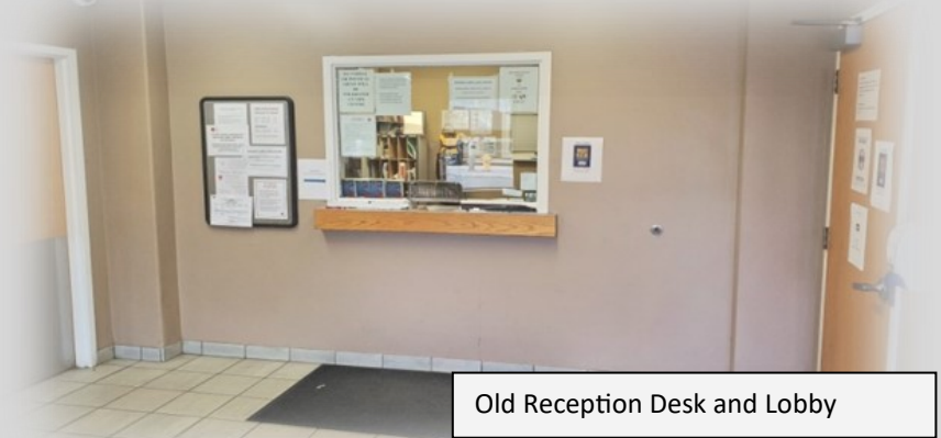
Old Reception Desk and Lobby

The wheelchair accessible entry includes a 270 degree view main reception desk, lobby area with bench sitting, water bottle filling station, and public washroom.